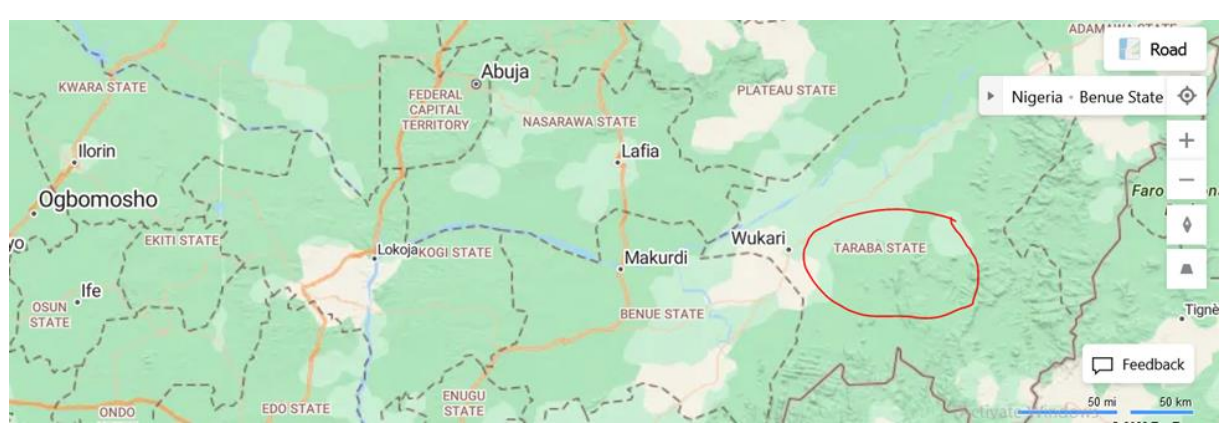
Fig. 1. Taraba state on map

In terms of climate, Taraba State experiences a tropical savannah climate, with distinct wet and dry seasons. The rainy season typically lasts from April to October, while the dry season extends from November to March. The state receives a relatively high amount of rainfall, particularly in the southern part, which supports agricultural activities.