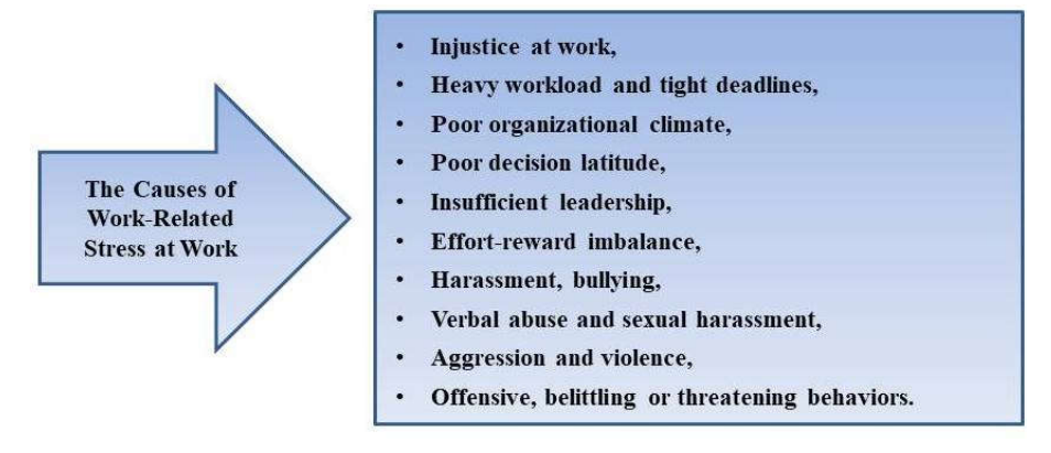
Figure 1. The Causes of the Work-Related Stress at Workplace

Stress, including work-related stress, is not a sickness; it is a state and causes variety of diseases or disorders in terms of physical, psychological, and behavioral concept. Moreover, it can be an important reason of illness and it may result in with higher levels of sickness absence, emotional exhaustion, employee burnout, staff turnover and other interpersonal conflicts and organizational problems. It can be argued that stress is a natural response to over pressure and work-related stress occurs because an individual cannot contend with the demands being placed on him/her such as excessive job demands and resource inadequacies and contending refers to balancing the demands and pressures placed on any individual dealing with the job requirements with his/her skills and knowledge or capabilities. Hassard et al. (2018) pointed out in their study that work-related psychosocial risks, which cause work stress, are associated with the structures and features of work design, the organization and management of work within their social and environmental concepts, which have the potential for causing psychological, social, or physical harm to the individuals at workplaces. Figure 1. shows the causes of the work-related stress in organizations: